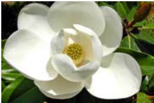
MAGNOLIA GRANDIFLORA Southern magnolia