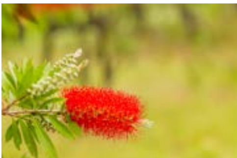
CALLISTEMON CITRINUS Bottlebrush