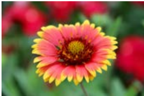
GAILLARDIA PULCHELLA Blanketflower