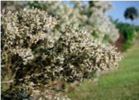
BACCHARIS HALIMIFOLIA Ground-sel bush