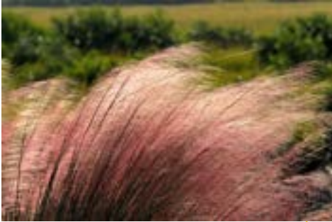
MUHLENBERGIA CAPILLARIS Muhly grass