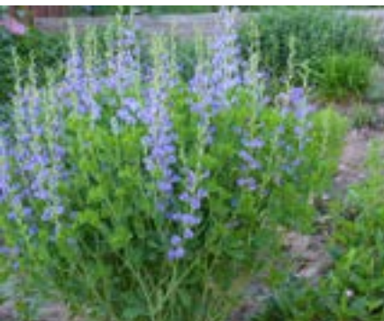
BAPTISIA species Baptisia/false indigo