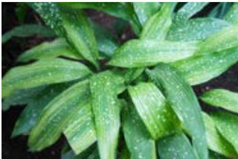
ASPIDISTRA ELATIOR Cast iron plant