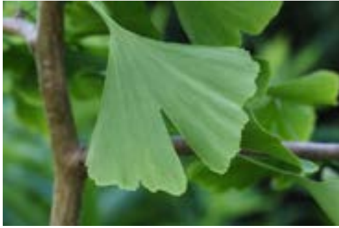
GINKGO BILOBA Ginkgo

Note: Female ginkgo trees produce unpleasant-smelling fruits.